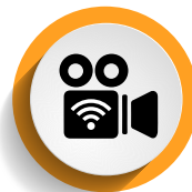
Remotely Records Videos and Images