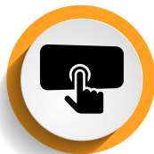
High Resolution 7" Indoor Display Unit

Now you can choose whom you open your doors to in a smart, contactless way! Isn't it amazing how Godrej technology secures your peace of mind, no matter where you are!