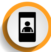
Smart Phone Viewing