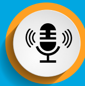
Plays Voice Prompt "Shake your Head to make a call"