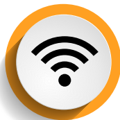
First True Wifi Video Door Phone