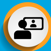
Indoor Monitor / Smart Phone Receives External Call

Smart Safety the contactless way! Now say goodbye to missing your visitors because you aren't home and the worry of sanitizing your doorbell every time someone rings it! Simply relax at home or go anywhere in the world and still stay connected to your visitors with the built-WiFi module of SeeThru Contactless Video Door Phone. The WiFi feature enables you to see and talk to the ones at your doorstep through the SeeThru app on your smartphone. SeeThru Video Door Phone enables contactless calling without the visitor touching the door bell, reducing public contact.