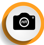
High Resolution Wide Angle Camera