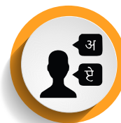
13 Regional Languages to select for a Voice Prompt