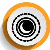
White LED for Night Vision