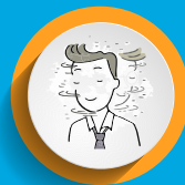
Detects Shaking Head Behaviour